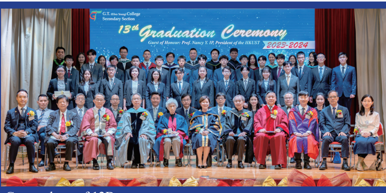
Group photo of 12D