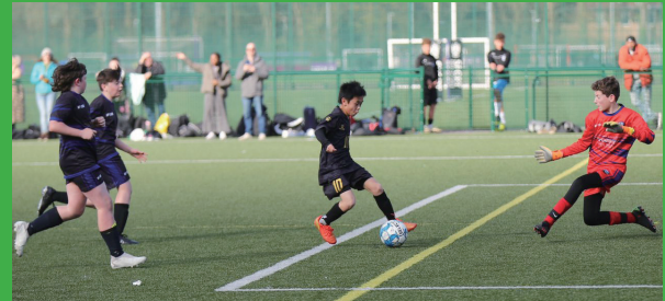
Wonderful photos of our players, playing against Rycob Lions