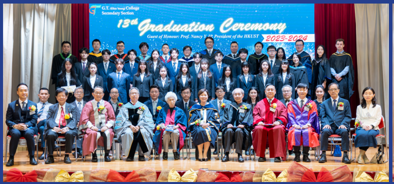
Group photo of 12C