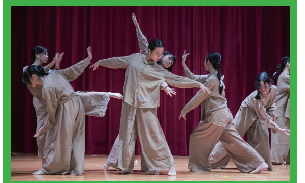
The Creative Dance class giving an astonishing performance