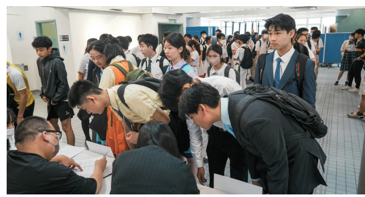
Participants registering and waiting to enter the examination