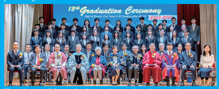
The winners of the academic, conduct, and service awards