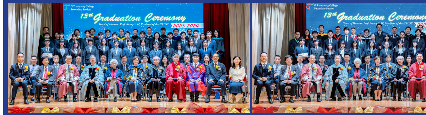
Group photo of 12A