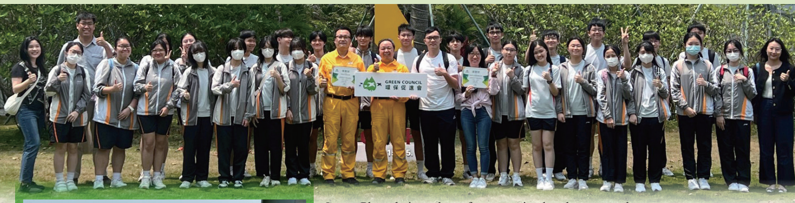
Group Photo being taken after we arrived at the power plant