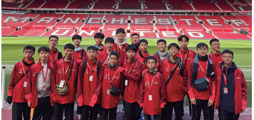
Posing a for team photo in Old Trafford

20 students were selected to represent G.T. College to participate in the Manchester International Easter Cup. The event took place from 28 March to 6 April in Manchester, United Kingdom, to enable teams all over the world, including: Ireland, Trinidad and Tobago, Australia, and Scotlandto enhance their skills and friendships among players. Despite a significant disadvantage in size and individual skills, the kids worked hard as a team, keeping their spirits high. They finished 3rd in the group stage and placed 5th out of ten teams overall.