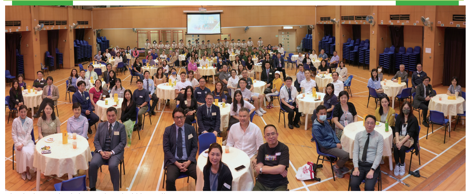
The sharing session being conducted within small groups