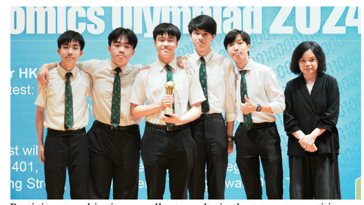
Participants achieving excellent results in the team competition