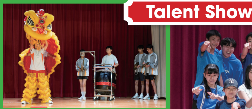
Lion Dance performance with live musical accompaniment