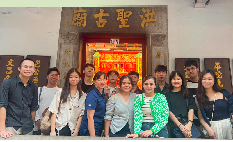
MWIT students visiting the historical Hung Shing Temple in Wan Chai