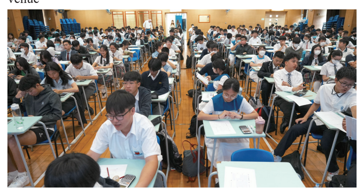
Nearly 400 participantis from about 60 renowned local and international schools