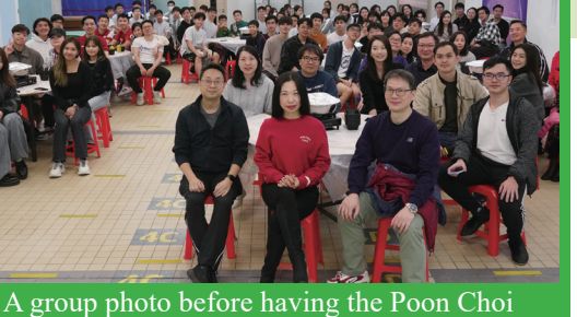
A group photo before having the Poon Choi dinner