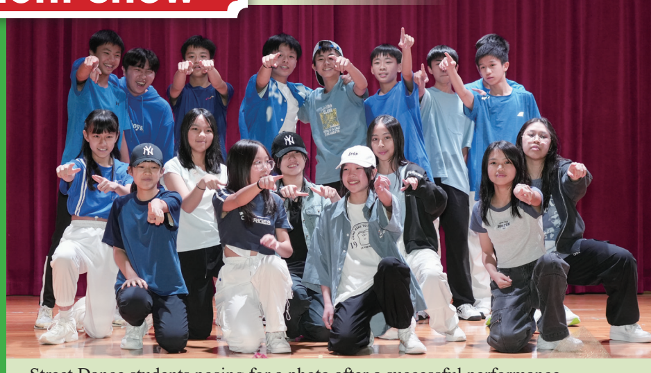
Street Dance students posing for a photo after a successful performance

The G.T. College Talent Show 2024 was an amazing annual school event. It was very successful in allowing students to demonstrate their talents.