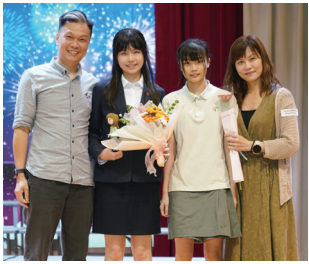
Appreciation for parents