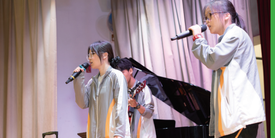
Students from the Pop Band class performing a duet