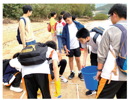
A group of ZPL students collecting sand samples for microplastic collection

Zero Plastic League (ZPL) organized a beach clean-up activity for school students on 1 June 2024 in order to clean up the beach and collect data for environmental research. We hope the activity will increase students' awareness of plastic pollution. The collected data about the number and types of microplastics will also be contributed to the online database, helping to create the global map of ocean microplastic pollution. To make the cleanup experiences rewarding, ZPL students conducted two pre-field trips to Sha Lan Beach in Tai Po on 23 March 2024 and Nim Shue Wan Beach in Discovery Bay on 13 April 2024 to learn of the site information. Nim Shue Wan Beach in Discovery Bay was finally chosen to be the beach cleanup site. Stay tuned for further updates!