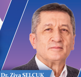
Dr. Ziya SELÇUK Türkiye Former Minister of Education of Türkiye