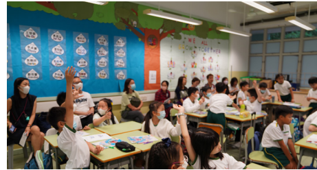
▲同學們積極回應，踴躍參與課堂