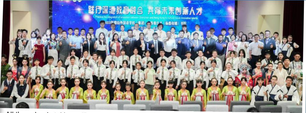
All the schools taking a "Big Pic" together

On 22 April 2023, G.T. College visited Shenzhen Nanshan Foreign Language School - Kehua School to promote educational integration between Shenzhen and Hong Kong. The event included a school tour and performances showcasing different musical talents to facilitate in-depth communication.