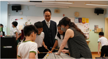
▲同學們與組員合奏一曲