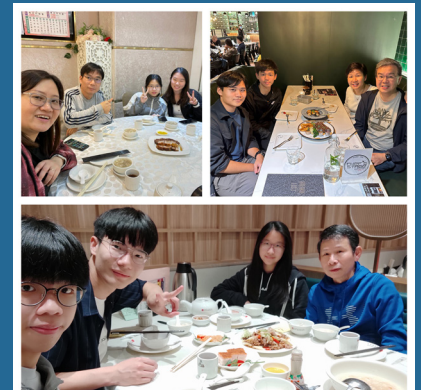
Thank you all host families for your hospitality and generosity!