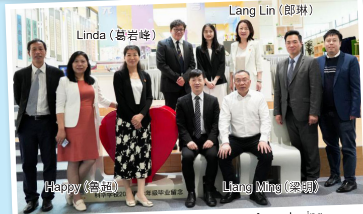
Management from both schools meeting up for a sharing