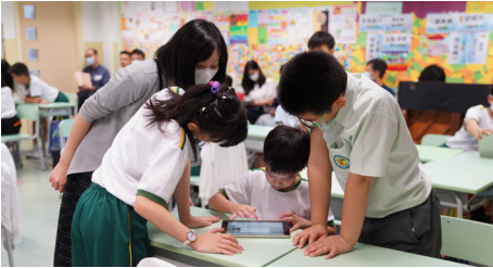
▲同學們利用 iPad 進行小組活動

感謝老師們的努力、家長們的支持，活動得以順利進行，四天的觀課日合共有 241 位家長參加，場面非常熱鬧。