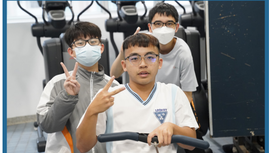
Taiwan students having fun during Sports Friday