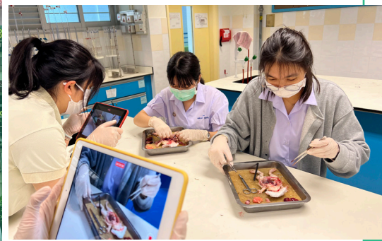
MWIT students doing a biology dissection experiment in the a special Biology lesson