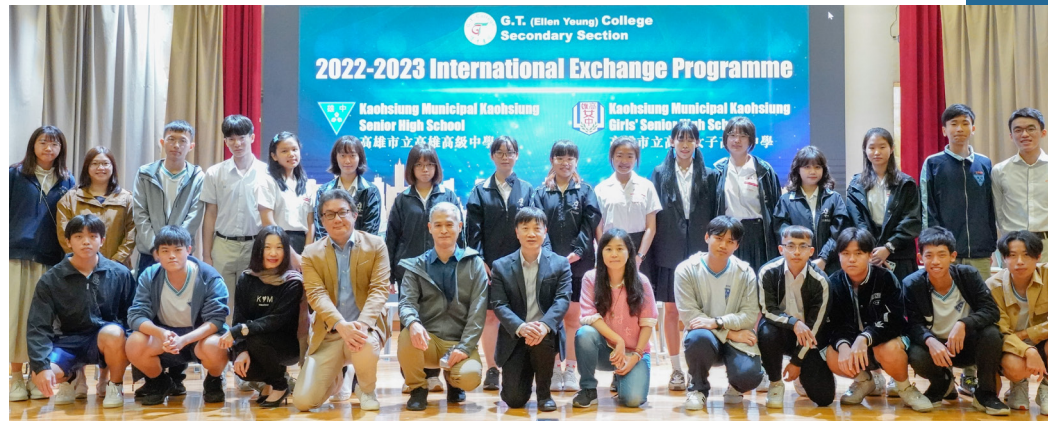
All the participants taking a memorable photo in the school assembly