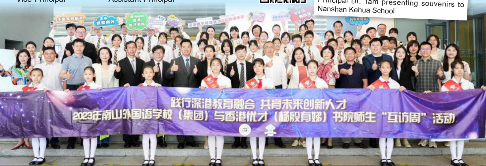
All the participants posing for a photo at Nanshan Kehua School