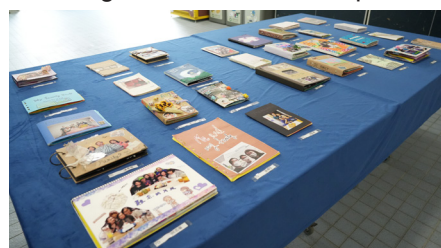
Family albums by G7 students being displayed on the 3rd floor