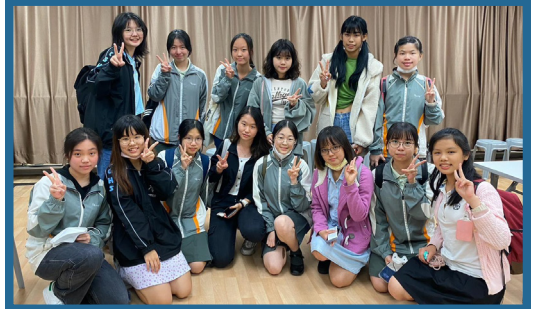
Taiwan students meeting their G.T. buddies on the first day