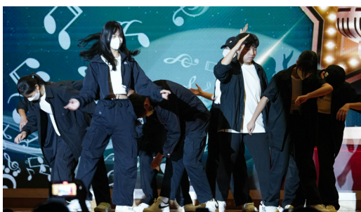
G.T. students performing their dance