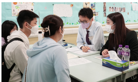
G.T. class teachers and parents discussing during a parents meeting

Our 2022-23 Term Two Parents' Day was successfully held on 15 April. This was the first Parents' Day after the Covid-related mask-wearing requirements and social distancing measures were lifted by the government. As a result, the arrangement of waiting areas on each floor of our campus was cancelled. Visitors were no longer required to travel in certain directions according to signage. We enjoyed this relatively carefree atmosphere. While class teachers interviewed parents in classrooms, non-class teachers had a more informal chat with parents waiting outside. Teachers from the Moral Education Group (MEG) interviewed parents of those whose performance required special attention. Several art exhibitions around the campus showcased excellent student work. It was a day when we had a good time together with parents.