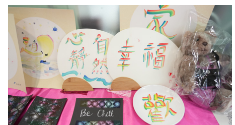
Student artwork being shown on the ground floor