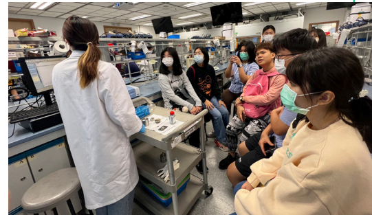
MWIT students observing the Chemistry experiment at a Chemistry lab at HKUST