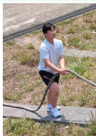
Climbing the slope is not easy!