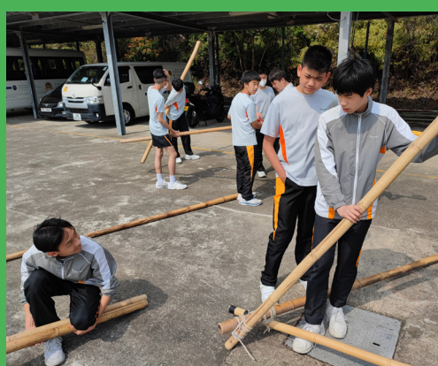
G8 students building the catapult together