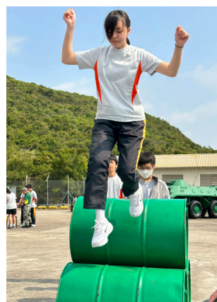
Great challenge overcome!

Form 10th-11th March 2023, our G8 students and class teachers went for an overnight camp at Sai Kung Man Yee Training Camp. Led by trainers of the Hong Kong Adventure Corps, students participated in a series of challenging activities such as abseiling, foot drilling, catapulting and night walking. They made a lot of unforgettable memories, especially after a long halt of outdoor activities under the pandemic.