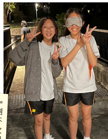
Night walk and a game of trust