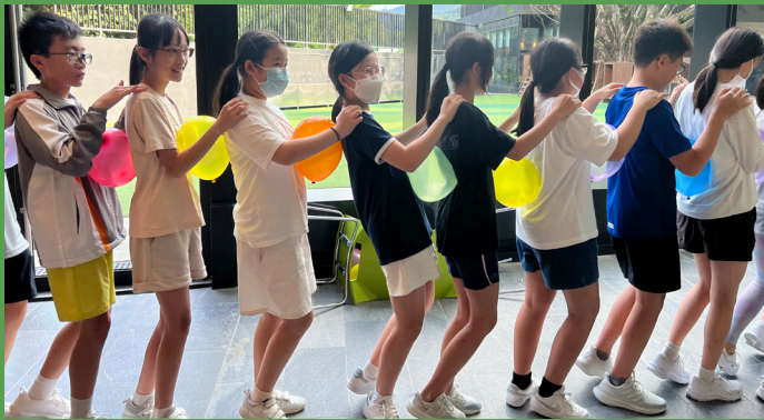
Happy train cars linked by balloons