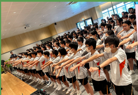
Warm up exercise early in the morning

In the game, at first, we finished in 30 seconds. It's quite a long time in finishing this game. After that, we thought of a faster way. Then, we trained for several times. At last, we finished in 10 seconds. I was moved at that moment because I saw all of us were sticking together to achieve a goal. After this activity, everyone smiled. Then I learnt that we should encourage others, observe other's good points and learn from them. Also, I learnt that we should listen to others.