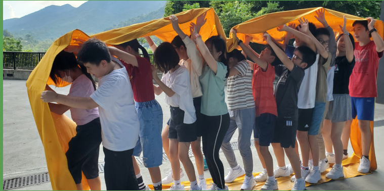
Rolling the caterpillar thread

On 18th-19th Sep 2023, our G7 students and class teachers went to an overnight camp at Duke of Edinburgh Training Camp. Students participated in a series of discipline training, team-building activities and adventure challenges such as Ping Pong Rolling, Rolling the Big Tyre and Night Walk. They learned how to cooperate in a team. Also, they had a lot of unforgettable memories with classmates and teachers.