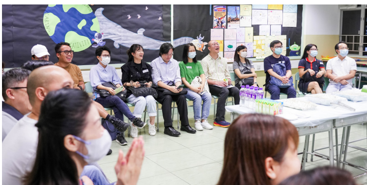
Parents commenting on their children's fruitful learning progress at G.T.