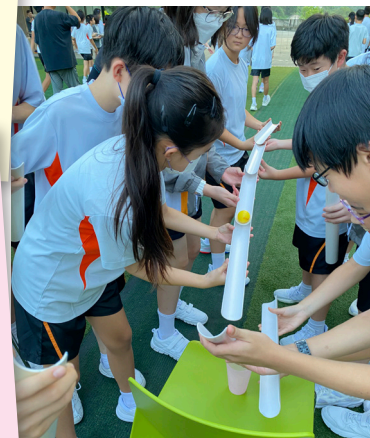
Ping pong ball rolling requiring concentration and diligence