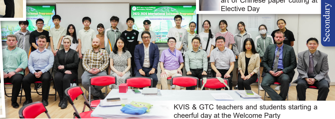
KVIS & GTC teachers and students starting a cheerful day at the Welcome Party