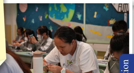
A KVIS student figuring out the art of Chinese paper cutting at Elective Day