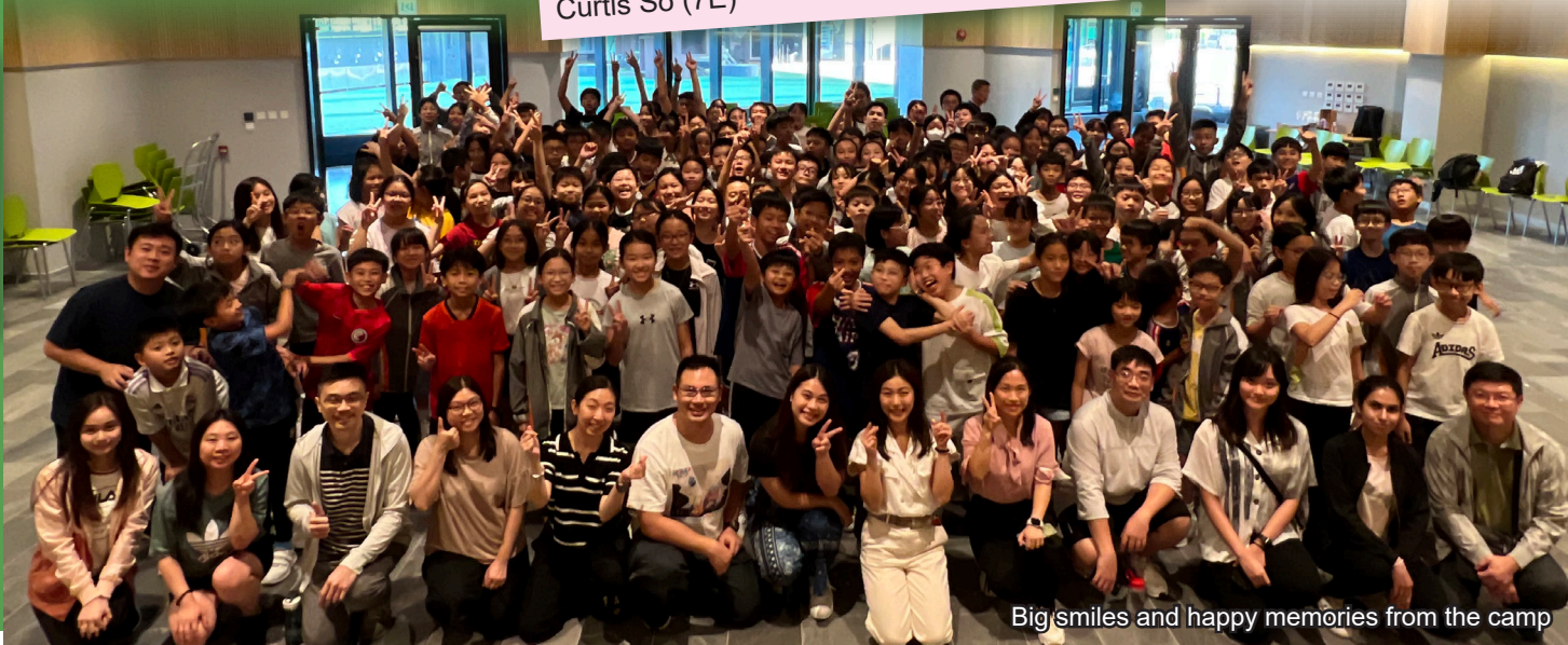
Big smiles and happy memories from the camp