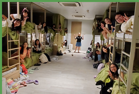
Too excited to go to bed a night

雖然在這個活動中，我們的組別獲得分數並不高。但在整個迎新營裡我學會了：做事前要好好計劃和想好策略。最重要的是：做任何事都要堅持不要放棄，還有要和人互相合作才能成功。我很欣賞 7B 全班同學，因為在所有活動中，沒有一個是可以獨自完成，全部都要和同學互相合作才可以完成。在這個迎新營中，我和同學的感情增進了，我們更團結。我們能完成所有活動是全班同學的功勞，這次迎新營一定能成為 7B 班的美好回憶。