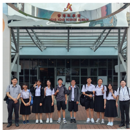
KVIS students visiting Hong Kong Science Park